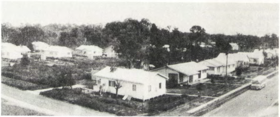
Plate 5— Murrin Bridge, 1983. A panoramic view taken from the water tower. AIAS N3577-3A.