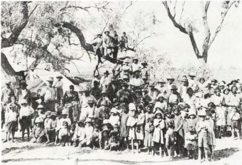
Plate 2 – Menindee Aboriginal Station, January 1934. A group photograph taken in its early days for the Adelaide Advertiser .

Photograph: AIAS N1601-3. Original photograph from the Aborigines Welfare Board Collection in the State Archives Authority of New South Wales. Supplied by AIAS.