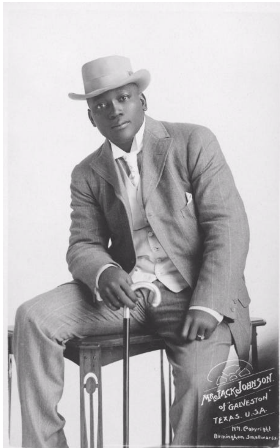
Fig 1 Dapper Jack Johnson wearing his beige tweed suit, 1908. NAA A1861, 848 'Boxer Jack Johnson of Galveston, Texas'.