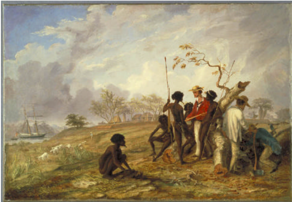
Figure 2: Thomas Baines with Aborigines near the mouth of the Victoria River, NT. 1857. Painting, oil on canvas, 45 x 65.5cm by Thomas Baines. Rex Nan Kivell Collection NK129. National Library of Australia PIC T314 nla.pic an2273869. Shown are Thomas Baines with Aborigines near the depot camp. In the background can be seen the Tom Tough , one of the depot buildings, the mound enclosing the camp and a boab tree.

later went with them in the boat back to the depot. In a paper Wilson published after returning to England, he expanded on this meeting: