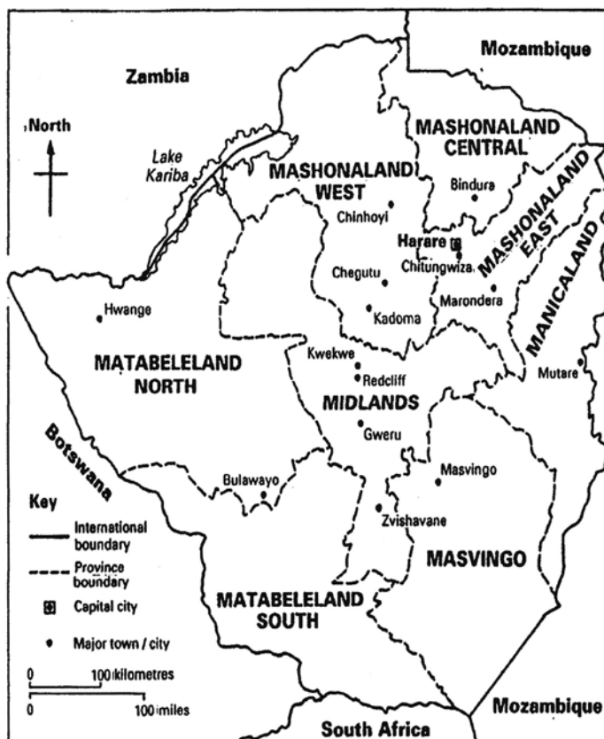
Map of Zimbabwe

Showing provincial borders and principal towns